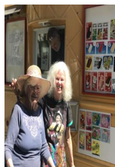
Ice Cream truck Visit