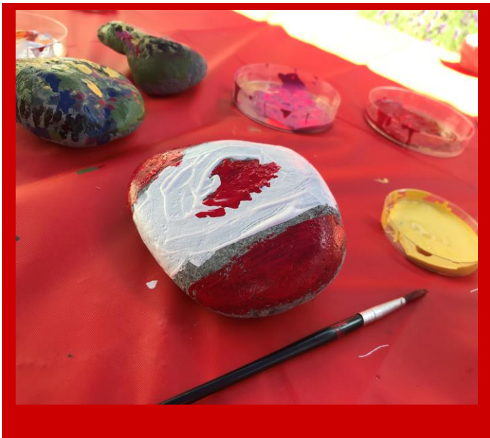
Second Street Community School and Normanna Seniors gathered on June 18 th for a "Stone Painting" to celebrate the birthday of Canada. There were approximately 200 children who came and enjoyed their time with our residents.