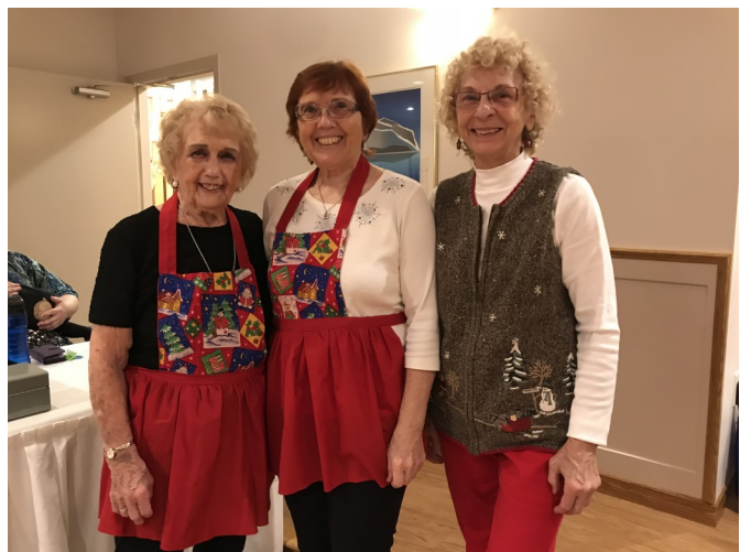
Members of Normanna Auxiliary at Christmas Bazaar