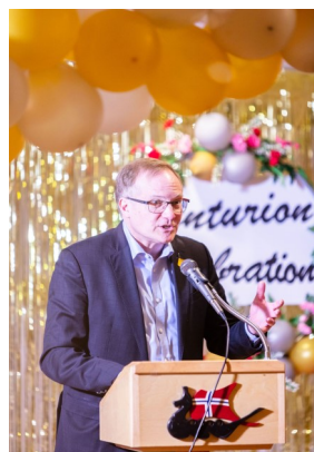
Member of Parliament Peter Julian